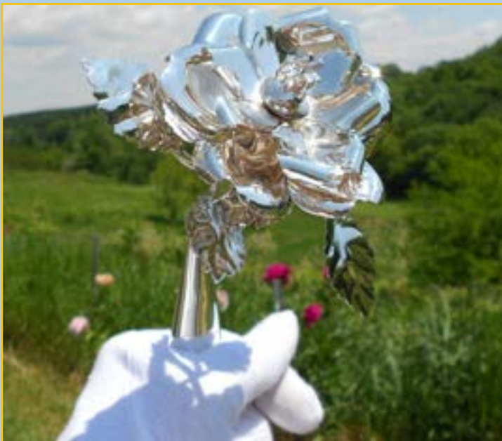
The Silver Rose and Our Lady of Guadalupe

You can share the message of Our Lady of Guadalupe and promote respect for life by participating in this meaningful pilgrimage. The Silver Rose program demonstrates the unity among Knights of Columbus in Canada, the United States, and Mexico through a series of prayer services that promote the dignity of all human life and honor Our Lady. So please, SAVE THE DATE: SUNDAY, MARCH 1 st , at 2 PM.