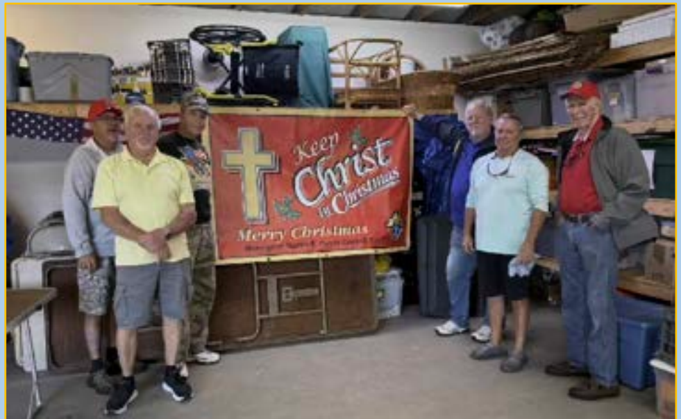
Nativity and KCIC Banner take down and clean-up crew